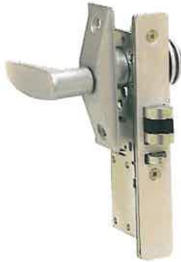
DEADLATCH LOCKSET 1-1/8" AL LH* AD100221

Note: Levers & cylinders sold separately