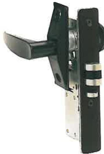
DEADLATCH LOCKSET 1-1/8" DURO LH* AD100223

Note: Levers & cylinders sold separately